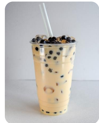
Oolong Milk Tea