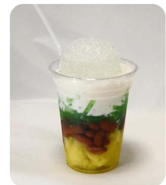
Chè Ba Màu

Chè Ba Màu – Yellow mung & red beans, Vietnamese jelly, and coconut milk topped with shaved ice