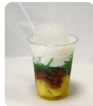
Chè Ba Màu